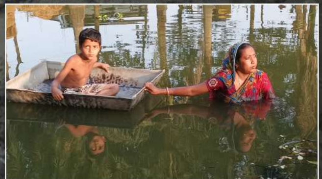
Organic Farming and Disaster-Rescue Training