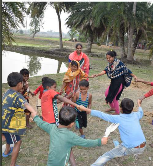
Different interventions amongst the vulnerable youth