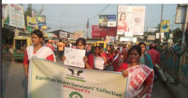
Rallies and Awareness campaigns in schools and the neighbourhood