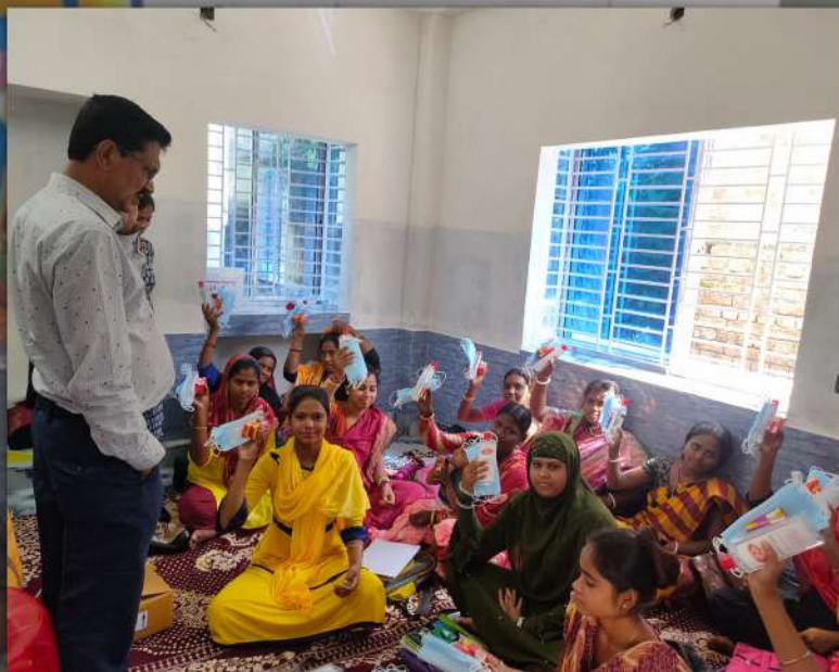
The Director meeting with the participants.

These courses were designed based on the aptitude assessments of the participants. The programme's primary objective is to empower marginalised women, fostering their self-sufficiency and independence. They also underwent counselling during the course for emotional support.