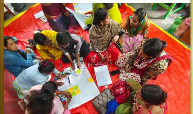
Above and Below: Youth Group activities and Training