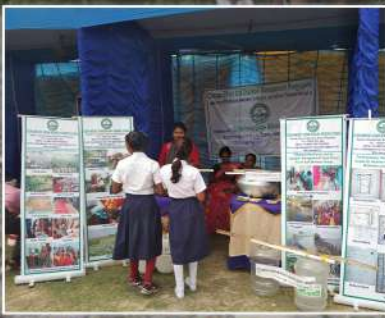
Anti Clockwise: GGBK's Demonstration to School Children

Interventions regarding Climate Change and Green Farming