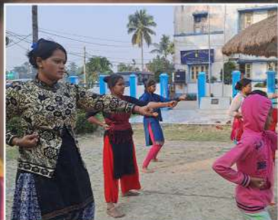
Anti Clockwise from Top: 'Yoddha' Programme, awareness campaigns, celebrations