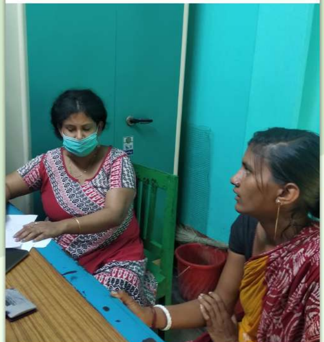
Psychiatric treatment of Survivors by Anwesha Workers